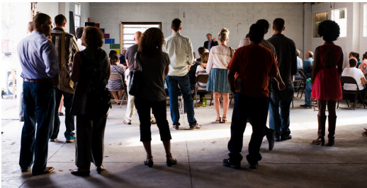
Creative Strategies for Change