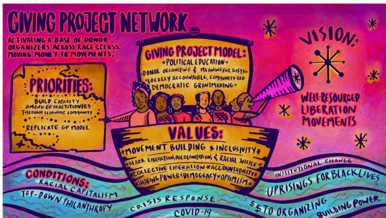
Art by Karla Rosas: IG @karlinche_

Visit chinookfund.org/givingproject to view the schedule, apply, and learn more.