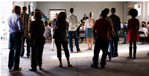
Creative Strategies for Change