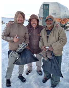
Hispanic Affairs Project (HAP)

Black-led Orgs: 19 (39% of BIPOC led orgs are Black-led. 36% of all grantees are Black-led)