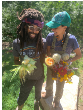
Front Line Farming