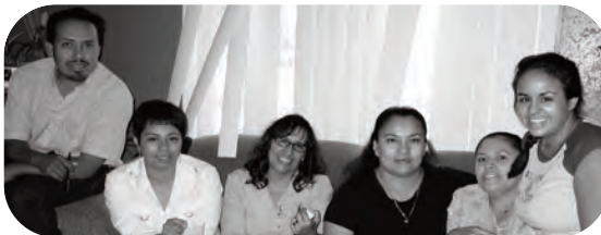
Social Justice Institute participants!

The Social Justice Awareness program works with non-profit and community organizations who seek to transform their environment into one that promotes inclusion, challenges oppression, and responds to diverse communities. Principles of anti-oppression, social justice and organizational development work are tailored to meet the specific needs of organizations committed to institutional change.