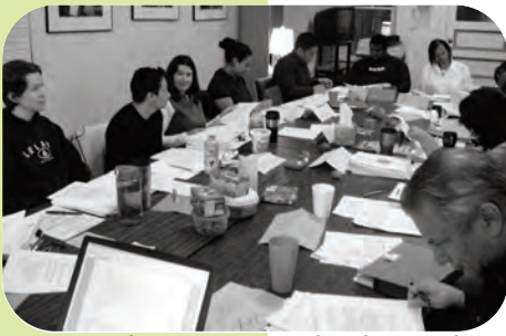
Grantmaking committee hard at work!

The Chinook Fund receives guidance and direction from its board and committees, which are comprised of volunteer community leaders committed to social change.