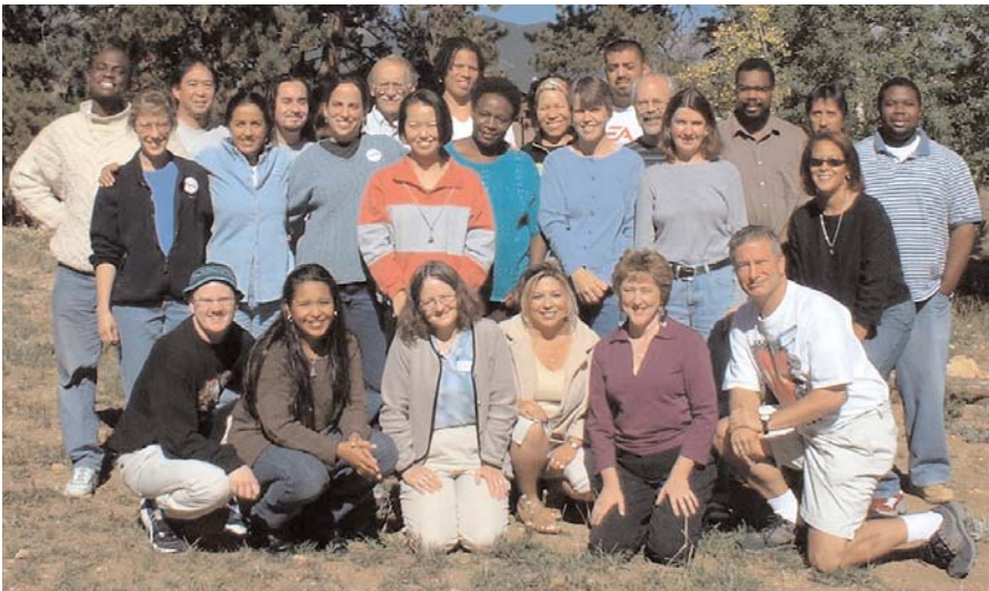
Chinook Fund Retreat ~ September 2002

The Chinook Fund is committed to the transformation of society into one that promotes social justice and freedom from oppression, including but not limited to, racism, sexism, classism, heterosexism, ageism, and ableism.